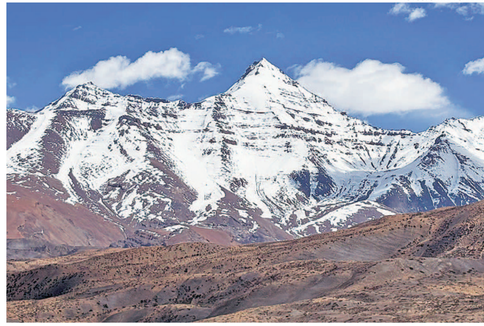
(Clockwise from far left) Dhankar monastery, Spiti; snow-capped peaks near Komic monastery; Kinner Kailash seen through prayer flags at Sangla Kanda

Unlike Spiti, this is lush green country with the snow mountains towering over the valley. But I could not find the forest of Bhojpatra trees that had fascinated me on my first trip to Sangla. Only an occasional specimen appeared among the cedars and maple trees.